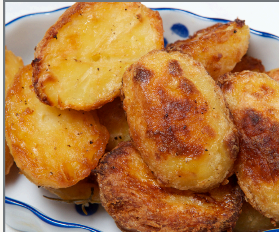
Turn leftover potatoes into Patatas Bravas

Most of us enjoy a juicy roast on Easter Sunday, but did you know that each year there are 5 million slices of left over meat. Try transforming left over lamb into a warming Shepherd's pie! #SustainableEaster