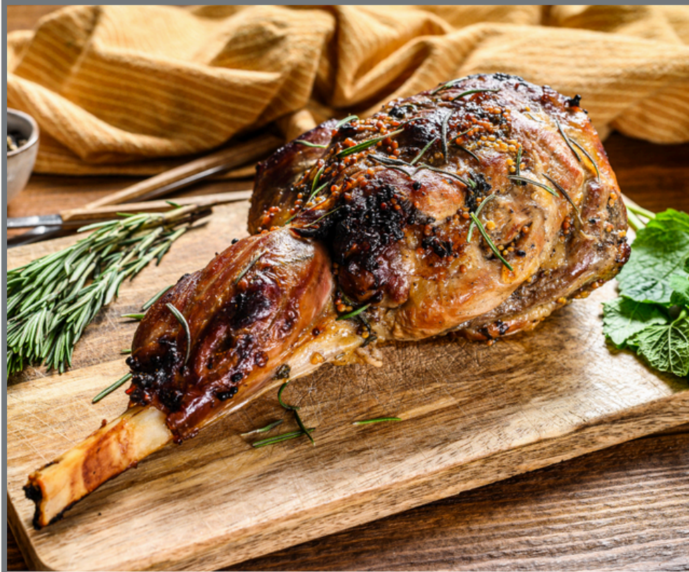
Turn leftover lamb into Shepherd's pie

Most of us enjoy a juicy roast on Easter Sunday, but did you know that each year there are 5 million slices of left over meat. Try transforming left over lamb into a warming Shepherd's pie! #SustainableEaster