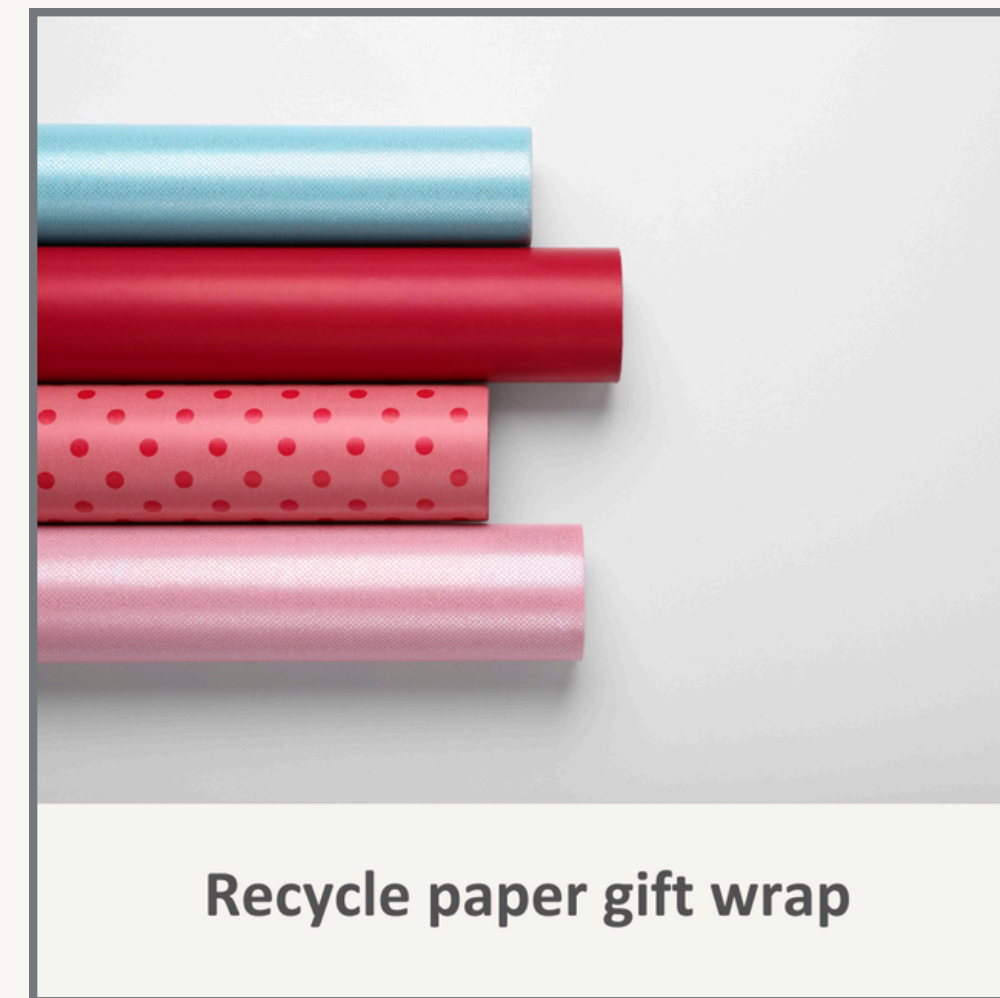
Recycle paper gift wrap

Most Easter egg packaging is recyclable. Remember to remove any plastic windows before popping the box in your recycling bin. #SustainableEaster