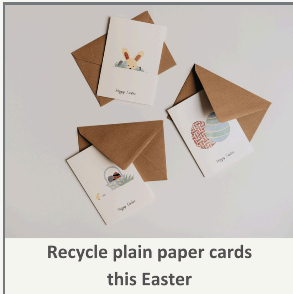
Recycle plain paper cards this Easter

Around 10 million cards are exchanged at Easter. Put paper cards and envelopes in the recycle bin. Put any cards with foil or glittery adornments in your general waste bin. #SustainableEaster