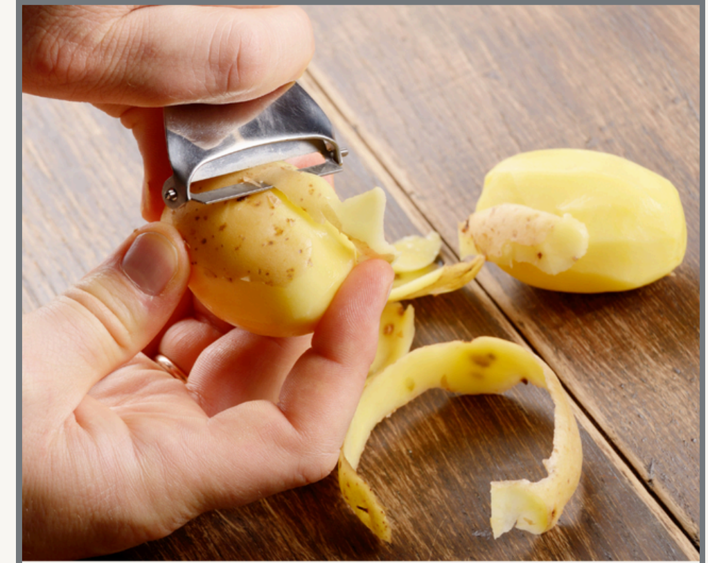
Turn peelings into tasty Pakoras!

Patatas Bravas anyone? Typically there are 20 million left over roast potatoes on Easter Sunday. Try giving them a tasty twist this Easter. #SustainableEaster