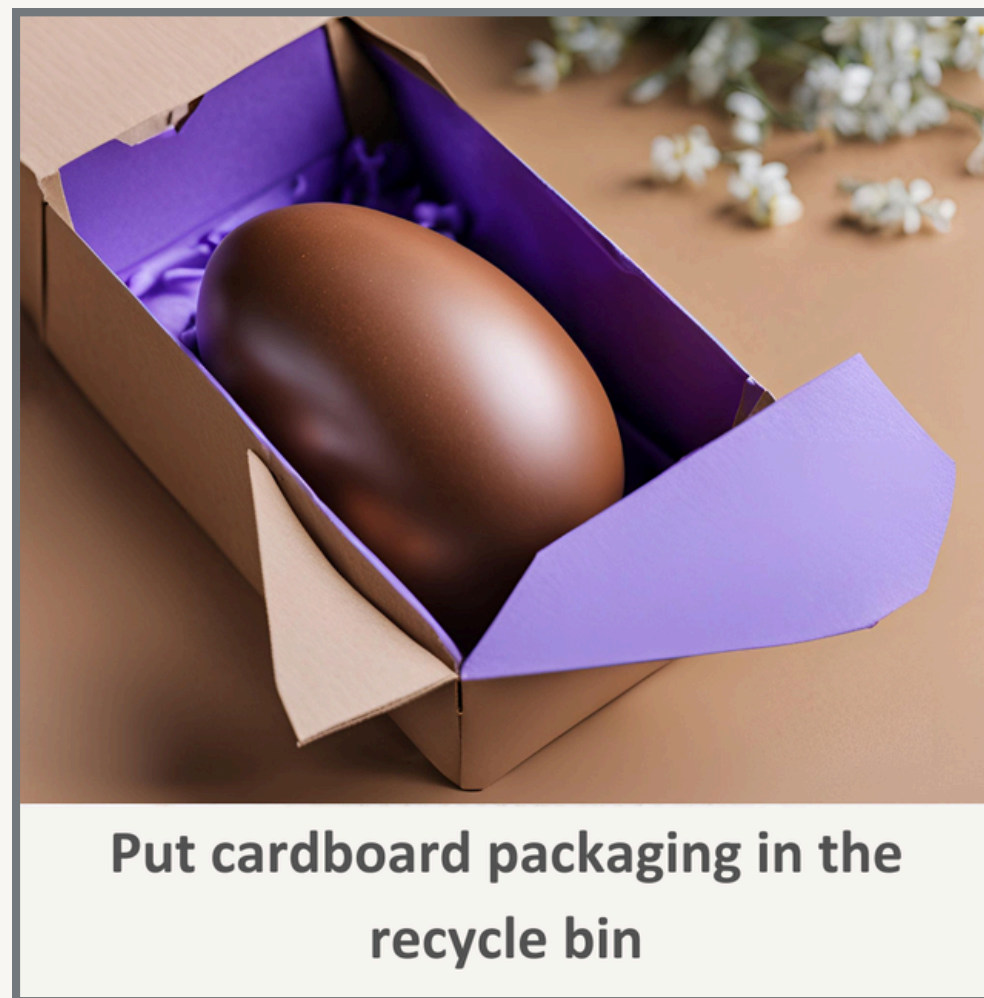
Put cardboard packaging in the recycle bin

Around 10 million cards are exchanged at Easter. Put paper cards and envelopes in the recycle bin. Put any cards with foil or glittery adornments in your general waste bin. #SustainableEaster